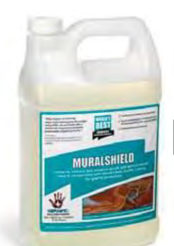
1 Gallon: Item WB0130 5 Gallon: Item WB0131

Coverage is approx. 400-600 sq ft per gallon. See data sheet for further details