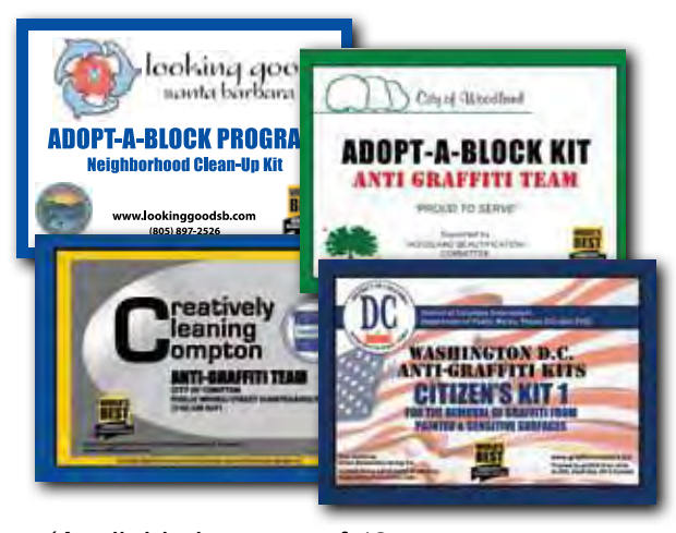
(Available in cases of 12. Custom Labeling available upon request).