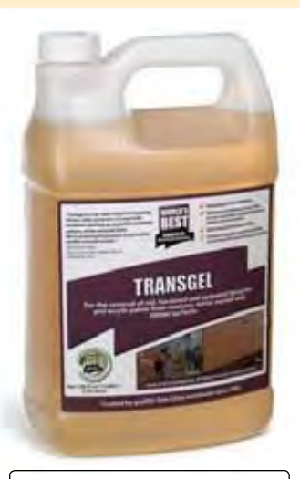
1 Gallon: Item WB0050

1 gallon will remove up to approx.150 - 200 sq ft.