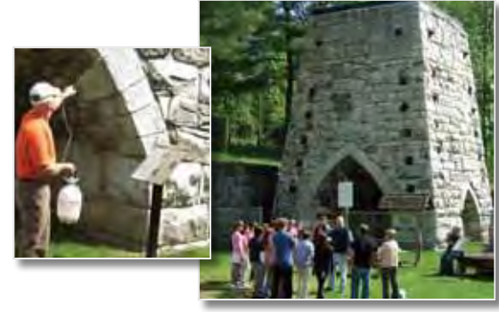
Friends of Beckley Furnace apply World's Best Graffiti Coating.

World's Best Graffiti Coating works in conjunction with MuralShield by offering long lasting protection for murals and artworks. See data sheet for further details.