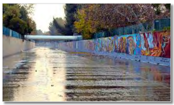
'The Great Wall of Los Angeles' © Judy Baca (the world's longest mural)