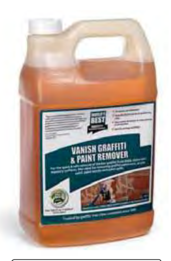
1 Gallon: Item WB0080 5 Gallon: Item WB0081