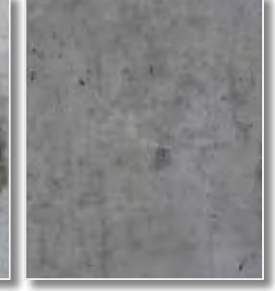
Removes ink stains from magic markers, leather dyes, boot polish etc. on porous surfaces such as concrete, stone, marble and terrazzo.