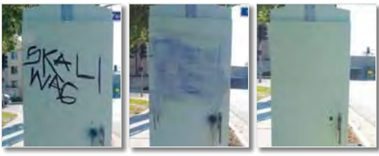
Removes ink stains from coated and painted surfaces.