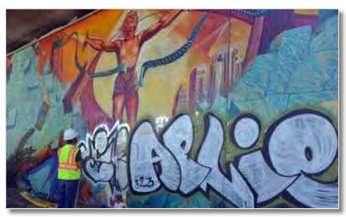
'Hitting the Wall' © Judy Baca (Los Angeles 110 Freeway)