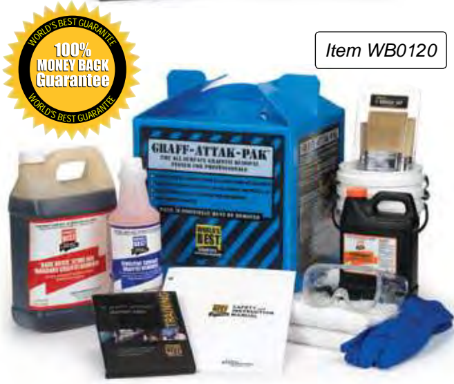
IDEAL FOR CITIES, SCHOOLS, FACILITIES, GROUNDS MAINTENANCE, DIY PROPERTY OWNERS & CONTRACTORS.