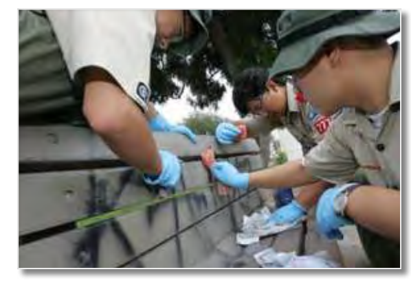
THE IDEAL GIVEAWAY FOR VOLUNTEER CLEAN-UP EVENTS

(Graffiti 'Afterwipes' are a handy substitute for a damp towelling cloth. Ideal for wiping down surfaces and hands).