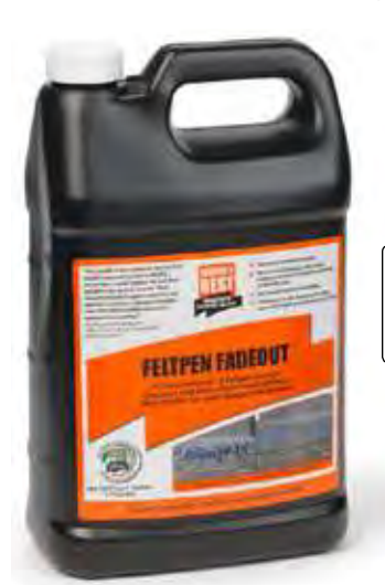
1 Quart: Item WB0032 1 Gallon: Item WB0030 5 Gallon: Item WB0031

Alternative uses include removal of eggs on signs and 'dusties' (which are caused by taggers pushing in grease and grime into painted walls). Water down 20:1 for general building wash down and organic stain removal from plants/algae and mold.