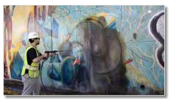
Cleaning graffiti after using Muralshield in conjunction with World's Best Graffiti Coating